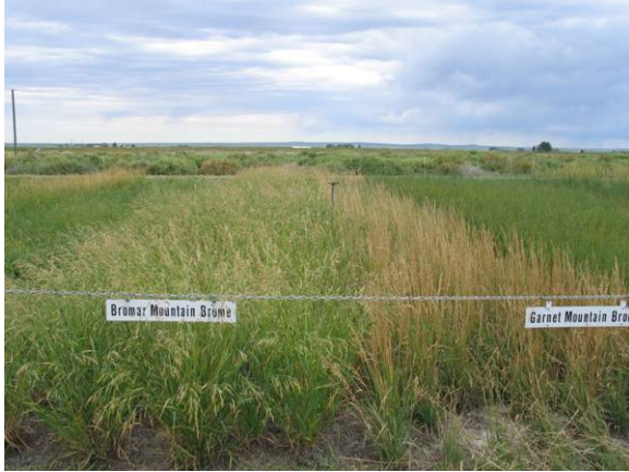
Aberdeen PMC Display nursery plots of Bromar (left) and Garnet (right).

'Bromar' was chosen from among 154 accessions collected in the Pacific Northwest and was released in 1946 cooperatively by Washington, Idaho and Oregon Agricultural Experiment Stations at Pullman, Moscow and Corvallis. It was selected for being taller, leafier and having better seedling vigor than commercial strains. It shows outstanding performance when planted in mixtures with sweetclover or red clover for short pasture rotations. Tests have shown Bromar to be moderately resistant to head smut, but chemical seed treatment is recommended. Breeder seed is maintained by the NRCS Plant Materials Center in Pullman, Washington and Foundation seed is produced by the Washington Crop Improvement Association.