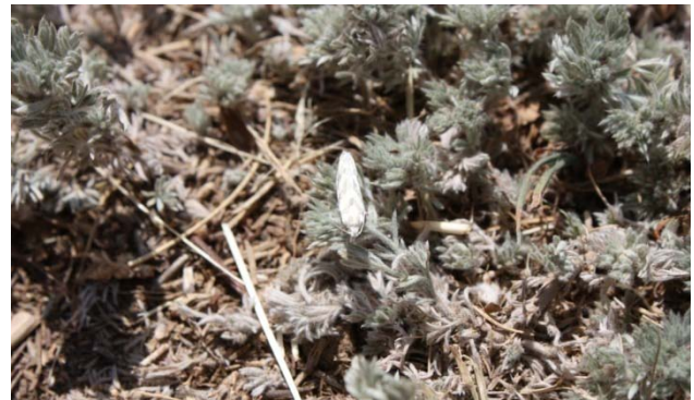
Figure 2: Eucosma ragonoti , moth on prairie sagewort.

Ethnobotanical: Prairie sagewort has a rich history of utilization by Native American tribes. Uses range from preservatives for meat, horsefeed, insect repellent (through burning of the plant), medicinal decoctions to alleviate toothache, headache, coughing, lung ailments, heartburn, and as a cold remedy. Early settlers used prairie sage to make a bitter tea which they believed was a tonic and remedy for typhoid fever. A. frigida is listed as a source of camphor although it has not been recognized by the U.S. Pharmacopoeia for this purpose.