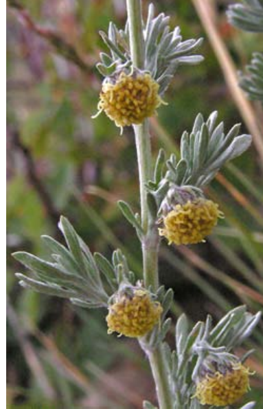
Figure 4: Prairie Sage, ( Artemisia frigida )

Due to prairie sagewort's drought and grazing resistant nature, it may increase rapidly and become dominant.