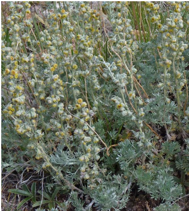
Figure 1: Prairie sagewort, ( Artemisia frigida ) photo ©Al Schneider, www.swcoloradowildflowers.com , used with permission.

Contributed by: USDA NRCS Colorado Plant Materials Program and the Upper Colorado Environmental Plant Center