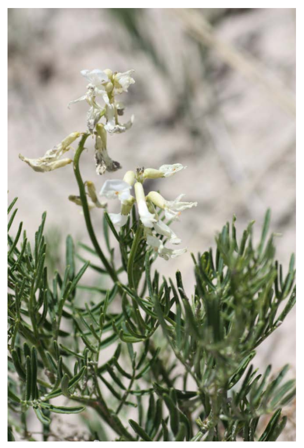
Figure 1: Kremmling milkvetch, (Astragalus osterhoutii). July 2010.

Contributed by : USDA NRCS Colorado Plant Materials Program