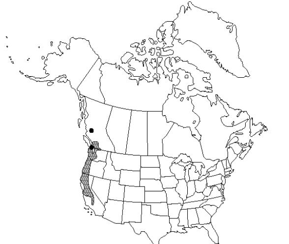
California hazelnut distribution map courtesy of the Flora of North America Association.

California hazelnut does well in full sun to full shade, and prefers moist but well-drained, loamy, acid soils with plenty of organic matter; it tolerates clay but not saturated soils. Plants are winter hardy to 0°F, and sprout readily from the root crown after top-kill by fire or other disturbance. It typically occupies damp rocky slopes and stream banks in the understory of coniferous or mixed hardwood forests at elevations up to 8000 feet in zones with mean annual precipitation of 14 to 100 inches. Distribution ranges from western British Columbia, Washington and Oregon to California (see map below). For updated distribution, please consult the Plant Profile page for this species on the PLANTS Web site.