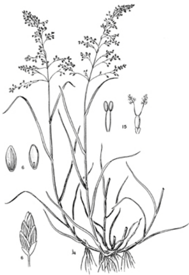
Line drawing of fowl mannagrass reprinted with permission, University of Washington Press.

Relative abundance in the wild: Seed ripens in July or August and retention within the flower head is fair to good. Collections can be readily made along wet forest road ditches, but access can be difficult along streams or in denser, swampy brush where this species is commonly found.