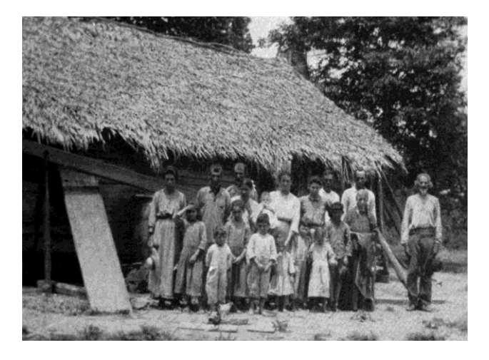
Figure 2. Houma Indians on the Lower Bayou Lafourche, Louisiana standing in from of a house thatched with either saw palmetto (Serenoa repens) or dwarf palmetto (Sabal minor). Photo taken in 1907.

(Bennett and Hicklin 1998; Bushnell 1909; Colvin 2006; Sturtevant 1955:504). Thomas Colvin (2006:80) describes the sustainable harvest practices of the Choctaw that he learned from the Johnsons: "The best palmetto (Serrenoa serrulata) [now Serenoa repens] grows where the marsh meets the swamp or bayou. When cutting it, I always leave stalks with one or two green fronds, as well as the center growing core of the plant, as the Johnsons [Choctaw] taught me to do, so that the plant will not die. This can be done twice each year. Palmetto baskets are made from the cortical layer of the stalks, not from the fronds." The Choctaw remove the rigid teeth from the petioles and split the stalks into five or six straws, peeled and trimmed them to the proper width, and dried them in the sun. They might be then dyed black, red, or yellow. Sifters, pack, heart, and elbow baskets all carry its leaves. The Seminole pounded corn into a powder, sifted it through woven palmetto fibers, and then placed it in a kettle of boiling water to make a porridge called sofkee (Covington 1993).