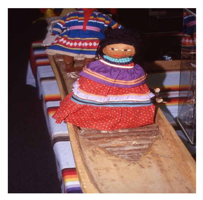
Figure 3. Seminole doll made from saw palmetto (Serenoa repens) leaf sheath fibers, Immokalee, FL. Oct. 1997.

The Seminole used the leaves for bedding in a temporary camp. The Chitimacha, Choctaw, Houma, Miccosukee, and Seminole thatched their houses with either saw palmetto leaves or the leaves of Sabal minor or Sabal palmetto . (Bushnell 1909; Campisi 2004; Sweeny 1936; Bennett and Hicklin 1998). The Miccosukee and Seminole made and continue to make dance fans and rattles used in ceremonies and toy dolls for children out of saw palmetto (Bennett and Hicklin 1998; Sturtevant 1955).