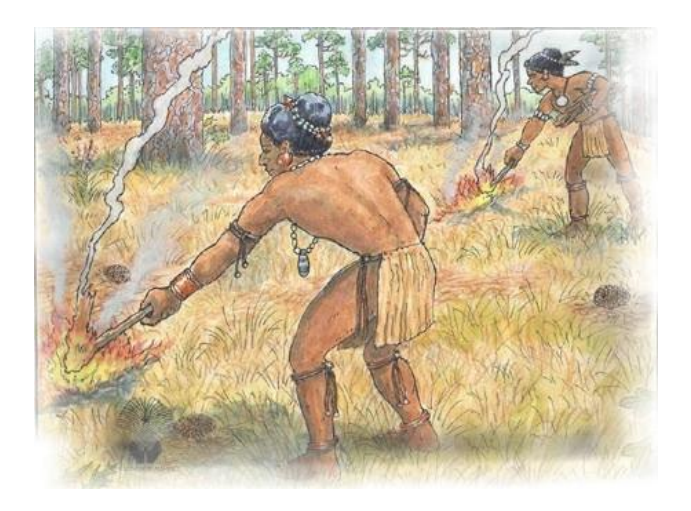
Figure 4. American Indians in the Southeast, burning the understory of a pine stand. Saw palmetto is often an understory associate with long leaf pine and native grasses.

Southeastern Indians set fires in the woods and prairies to foster the growth of important food plants, keep areas open to increase visibility and movement, drive game, increase palatability, accessibility, and nutrition of forage plants for ungulates, clear areas for farming, and other purposes (Stewart 2002).