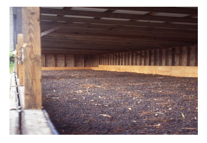
Figure 5. Saw palmetto (Serenoa repens) fruits drying at Plantation Botanicals, Felda, FL. Sept. 1996

that bears and panthers use as cover for dens (Conway Duever 2011).