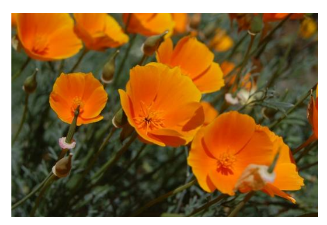
Figure 1. California poppy in bloom, showing unopened bud in left foreground.

General : California poppy is a flowering herbaceous annual to deep-rooted perennial. It is native to the western United States