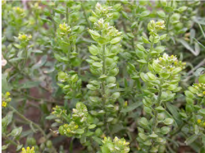
Figure 1. Desert madwort fruits are glabrous and compressed in the same plane as the septum.

Contributed by: USDA NRCS Montana PM Program