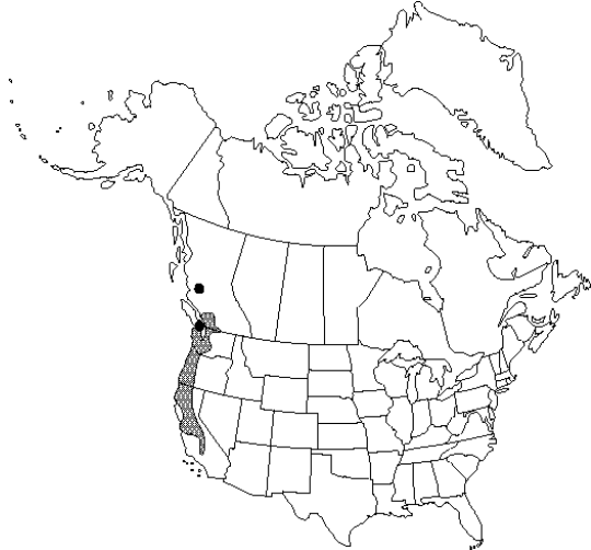
California hazelnut distribution map.

California hazelnut does well in full sun to full shade, and prefers moist but well-drained, loamy, acid soils with plenty of organic matter; it tolerates clay but not saturated soils. Plants are winter hardy to 0°F, and sprout readily from the root crown after top-kill by fire or other disturbance. It typically occupies damp rocky slopes and stream banks in the understory of coniferous or mixed hardwood forests at elevations up to 8000 feet in zones with mean annual precipitation of 14 to 100 inches. Distribution ranges from western British Columbia, Washington and Oregon to California (see map below). For updated distribution, please consult the Plant Profile page for this species on the PLANTS Web site.