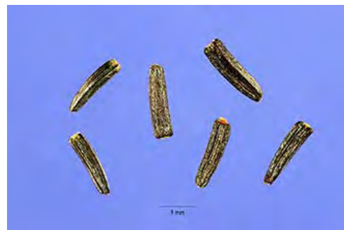
Figure 5. Rudbeckia hirta seeds are small and four sided.