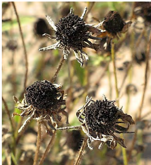
Figure 4. Signs of maturing Rudbeckia seed heads include dried ray flowers and a brown, woolly appearance.

Start black-eyed Susan transplants in the greenhouse. Direct sow into individual planting tray cells filled with sterile growing media. After sowing, cover the seeds with a thin layer of growing media and lightly water. Place the trays in a greenhouse set at 65°F-70°F daytime temperature and 55°F nighttime temperature (Butler and Frieswyk, 2001). Seed should germinate and emerge in approximately two weeks after planting. Thin to obtain one vigorous seedling. Keep growing media moist but not overwater because the plants are vulnerable to damping off or rot if overwatered (Phillips, 1985). Grow the transplants in the