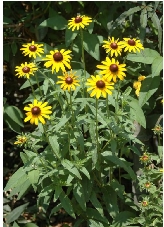
Figure 1. Black-eyed Susan in bloom.

General: Black-eyed Susan is a native, warm season forb in the Asteraceae family (Fig.1). Black-eyed Susan may be annual, biennial, or a short-lived perennial. The plant grows from a taproot which produces many stiff, coarse, upright pubescent stems 1 to 3 feet (0.3 to 0.9 m) tall (Tyrl et al., 2008). The alternately arranged basal leaves are up to 3 inches (7.5 cm) wide and 4 inches (10 cm) long and have either entire or slightly toothed margins. Each stem produces a solitary bloom up to 2.5 inches (6 cm) in diameter with eight to twenty yellow ray flowers around a flattish cone like structure (Ajilvsi, 2003). Black-eyed Susan blooms from summer through early fall (Ladybird Johnson Wildflower Center, 2019). The seeds or achenes are four sided, elliptical shaped, less than 5/64 inch (2 mm) long with no appendages or pappus (Tyrl et al., 2008).