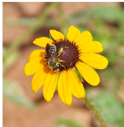
Figure 2. Black-eyed Susan is a pollen and nectar source for bees and butterflies.

Pests include aphids ( Aphididae sp.) which suck plant sap and produce a sticky honeydew. Diseases include downy mildew ( Sclerospora sp.) which attacks seedlings and produces light yellow spots on foliage, powdery mildew ( Erysiphe sp.) that