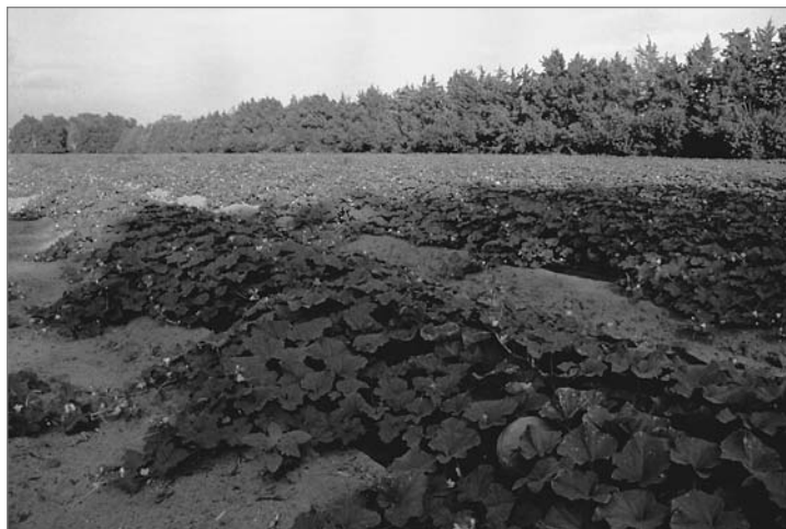
Windbreaks reduce wind speed and provide more favorable conditions for bee activity, which can increase crop pollination and yield.

Whether growing a hedgerow or windbreak, managing a riparian buffer, or farming near forests, agroforestry practices can increase the overall diversity of plants and physical structure in a landscape and, as a result, provide habitat for native pollinators. This is especially true if consideration is given to the specific habitat needs of bees when designing an agroforestry project. For example, a wide variety of flowering trees and shrubs can be incorporated into a hedgerow, or a diverse understory of insect-pollinated plants can be used to augment a riparian buffer. Planting specific trees for timber can also provide habitat for pollinators; black locust and maple, for example, supply abundant flowers and are excellent hardwoods that